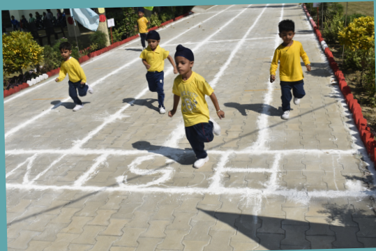
Sprints 50 meter