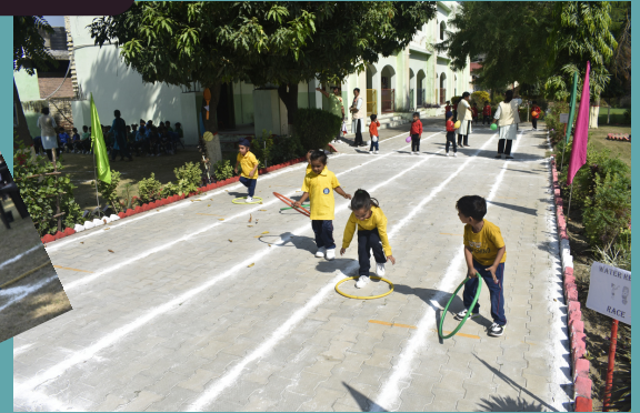
Hula Hoop Hurdle Race