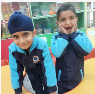
SENSE N' STYLE